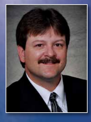
Class of 1982 Career Program Construction Electricity Member School